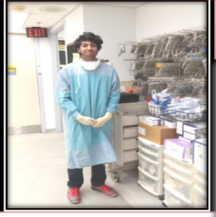
SHSM/Co-op Health and Wellness student at Mount Sinai

https://sites.google.com/gapps.yrdsb.ca/shsm-student/home